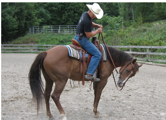
When we disengage the horse's hindquarters we take the "engine" off the tracks and momentarily interrupt forward motion.