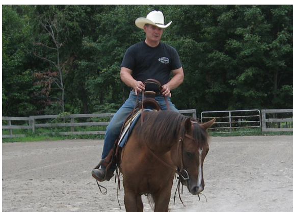
When a horse gives to the bit, he is simply following the feel of the rein and bending laterally at the poll.