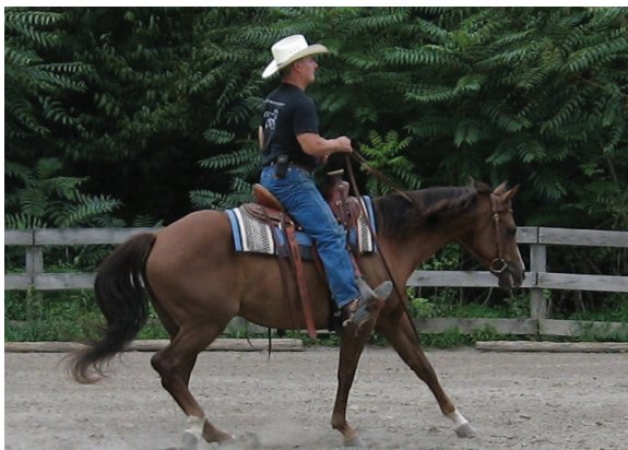
All of these baby steps lead up to gorgeous halts from the canter - talk about control!