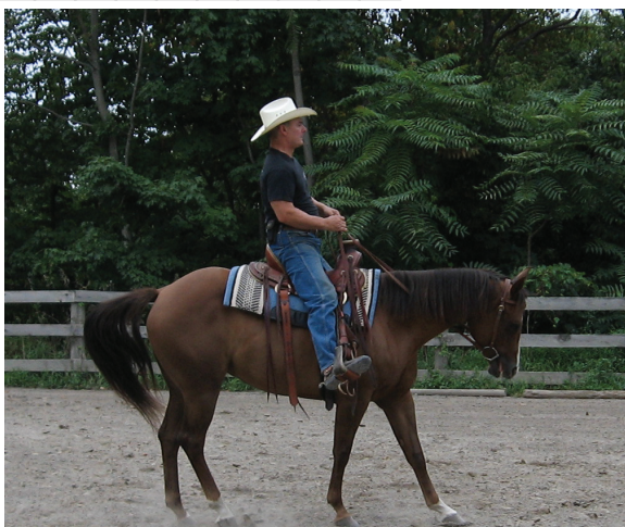
When your horse backs up on cue he is not running through the stop!